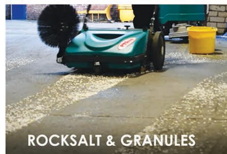
ROCKSALT & GRANULES