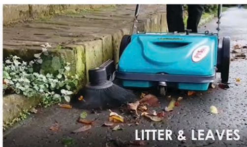
LITTER & LEAVES