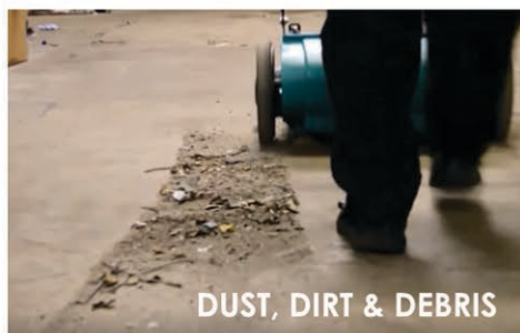
DUST, DIRT & DEBRIS