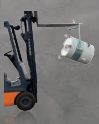
BIN EMPTYING KIT